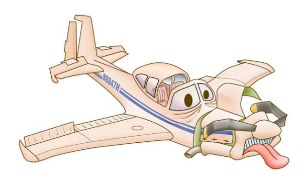
West Coast Navion Maintenance Seminar June 30 – July 2 Van Nuys