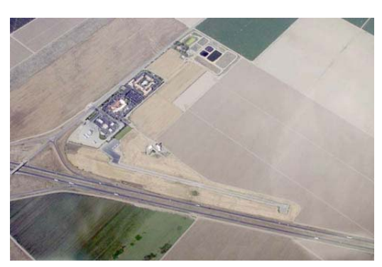
Harris Ranch (308) May 27th! See you there.