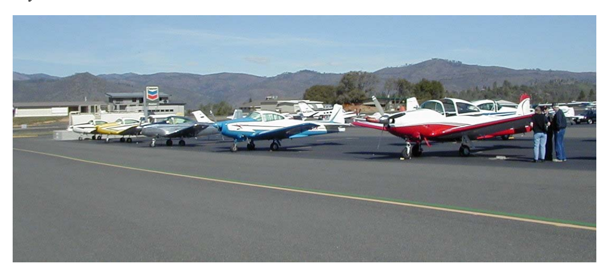
We took over the ramp at Pine Mountain Lake for a day

We had the great pleasure to see Hugh Smith once again and that just seemed to make the day for me.